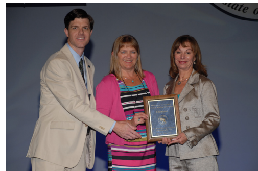
"Validating Leading Indicators for Learning Outcomes" Florida Virtual School