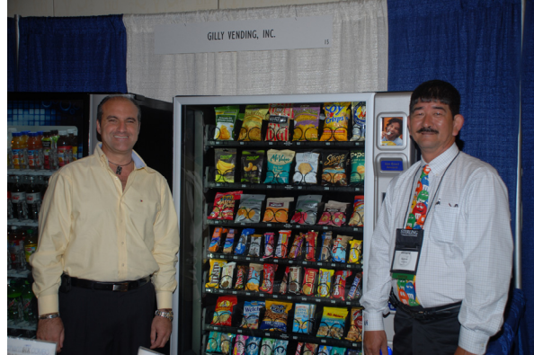
(Gilly Vending, Inc.)