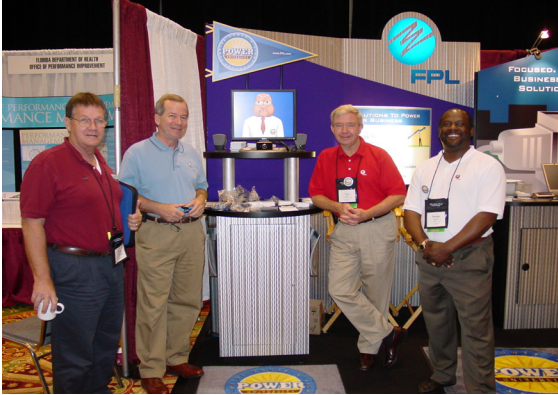
(Florida Power & Light)