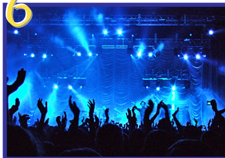
6 TEAMS COMPETE AT STATEWIDE TEAM SHOWCASE COMPETITION @ Sterling Conference – early June