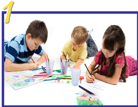
1 TEAMS WRITE & SUBMIT APPLICATION Due by March 15 th