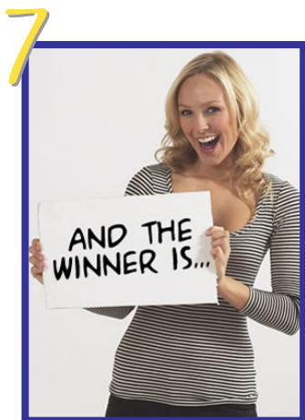
7 CHAMPION IS ANNOUNCED AT AWARDS BANQUET @ Sterling Conference – early June