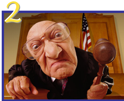
2 JUDGES EVALUATE APPLICATIONS End of March