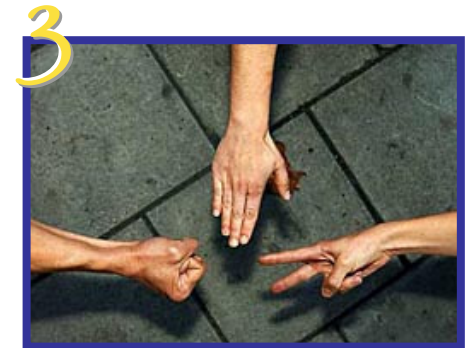
3 TEAMS ARE SELECTED TO COMPETE @ STERLING CONFERENCE Early April